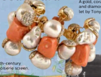
A gold, coral, pearl, and diamond bracelet by Tony Duquette.