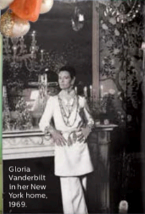
Gloria Vanderbilt in her New York home, 1969.