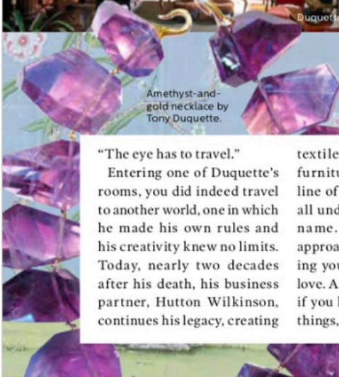
Amethyst-and-gold necklace by Tony Duquette.