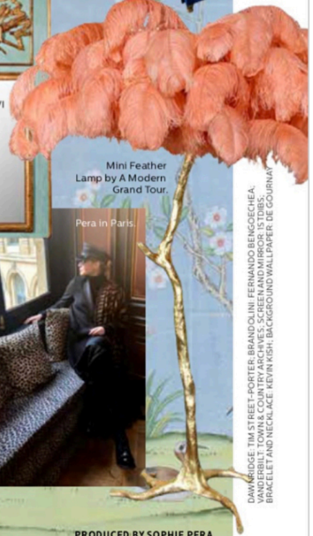
Mini Feather Lamp by A Modern Grand Tour.