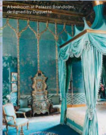
A bedroom at Palazzo Brandolini, designed by Duquette.