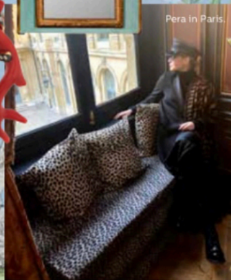
Pera in Paris.