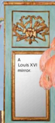
A Louis XVI mirror.