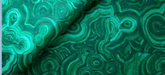
Gemstone fabric by Tony Duquette for Jim Thompson.