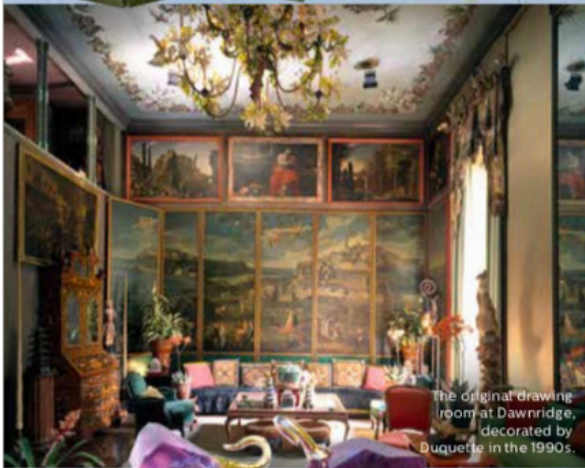
The original drawing room at Dawnridge, decorated by Duquette in the 1990s.